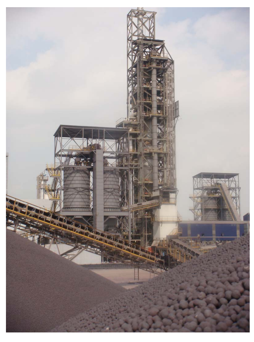
Gulf Sponge Iron Micro-Module DRI Plant at Mussafah, Abu Dhabi, UAE