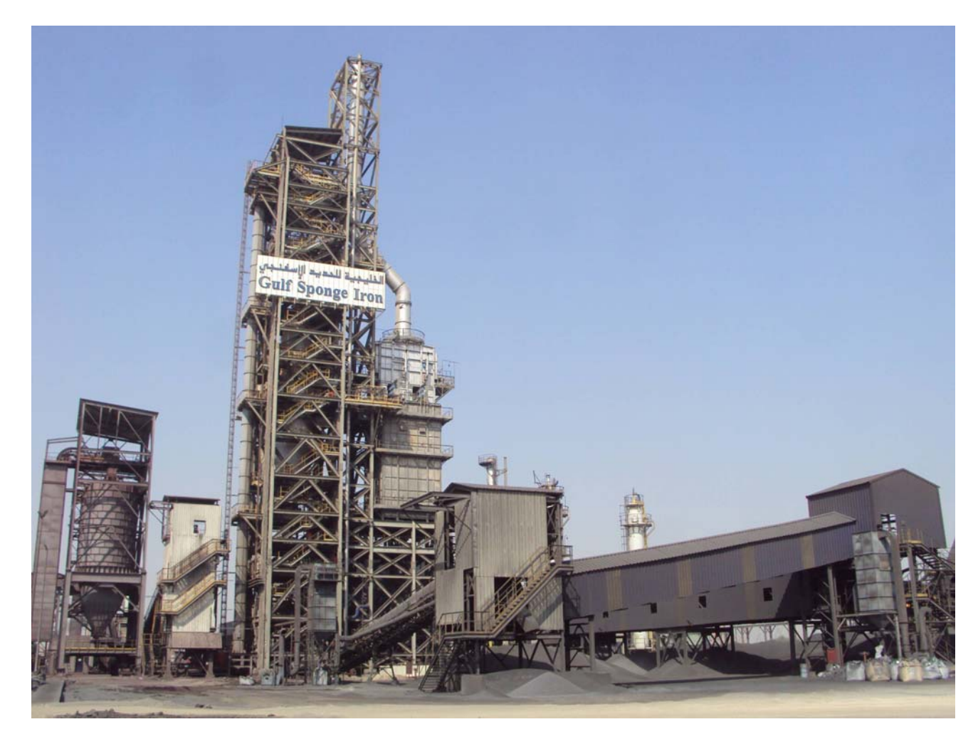
Gulf Sponge Iron Micro-Module DRI Plant at Mussafah, Abu Dhabi, UAE

metallization and carbon typically around 3.6%. The investment cost, despite the small size of the plant, is only slightly above the capex per ton of capacity as that of a large (>1.0 million tpa) plant. While the Micro-Module is of higher capital investment than the current coal-based plants used in India, it offers not only more capacity but also clean operation, higher quality, higher commercial prices for the product since demand is greater, and is an investment which will pay for itself in a short number of years. Additionally, it complies with the strictest environmental regulations and the possibility of having CO_2 as a saleable by-product and/or as CO_2 -credits.