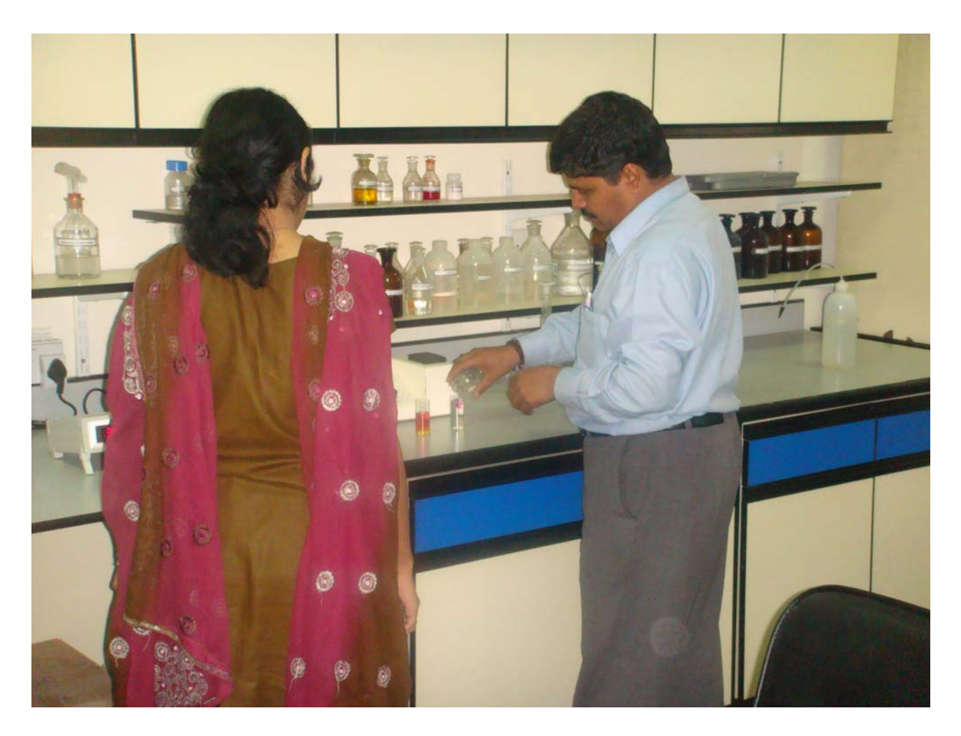
GSPI Quality Control Laboratory